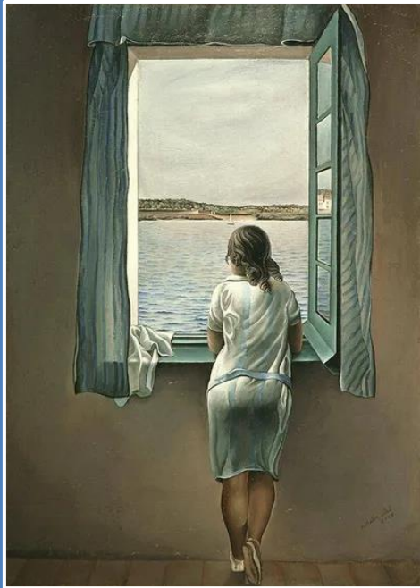
Salvador Dalí, Figura en una finestra , 1925