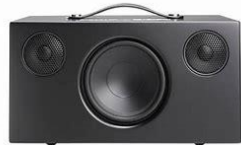
Audio Pro C10