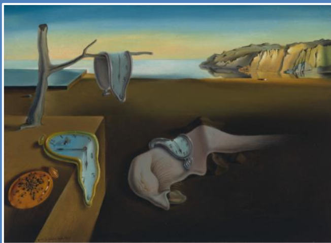
Salvador Dalí, La persistència de la memòria , 1931

Relax in this quiet area up the hills with the breath-taking views and enjoy all the treasures of the Valencia and Murcia region!