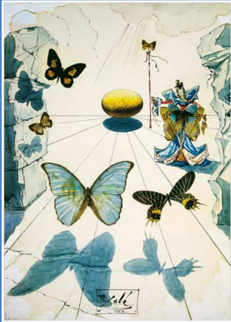
Salvador Dalí, Butterflies , 1950