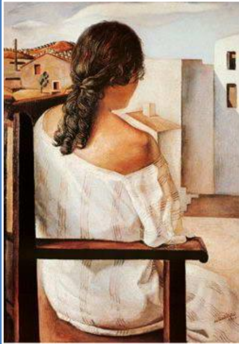
Salvador Dalí, Muchacha De Espalda , 1925